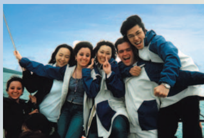
Exciting activities Sailing on Auckland harbour