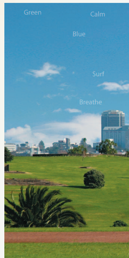
The road to your future