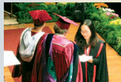
Earn your degree in only two further years University graduation ceremony