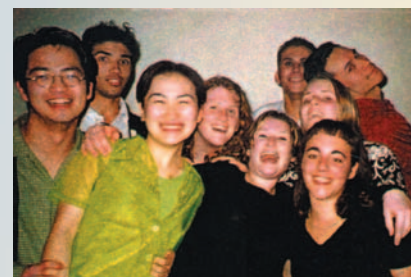
New friends from New Zealand Crown party