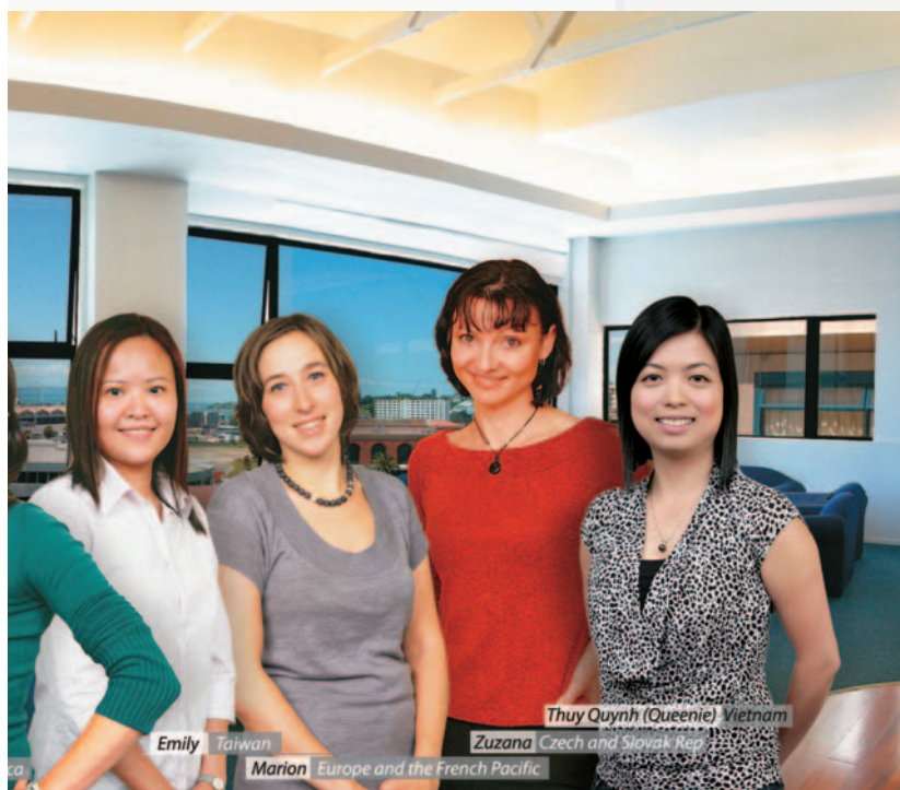
Location : Student common room - English College ●