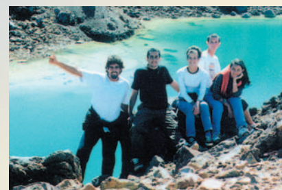
Beauty and adventure Tongariro National Park