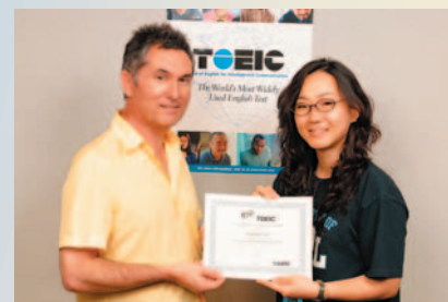
Crown - an official TOEIC test centre