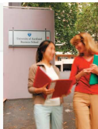
A historic building in a quiet, tree-lined street near the university, close to Auckland city centre.