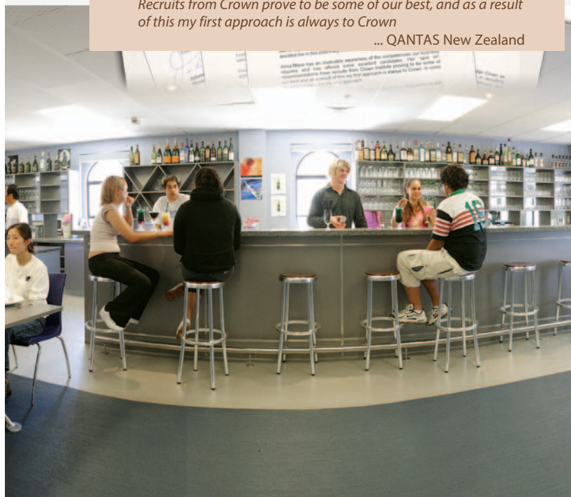
Location : Hospitality class - Business College ●

Recruits from Crown prove to be some of our best, and as a result of this my first approach is always to Crown ... QANTAS New Zealand