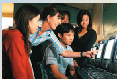
Preparing c.v.s in the Working Holiday option Internet suite - English College