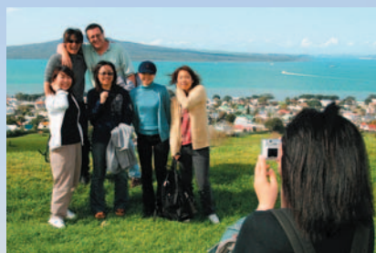
Happy memories of your classmates Mt. Victoria, Auckland