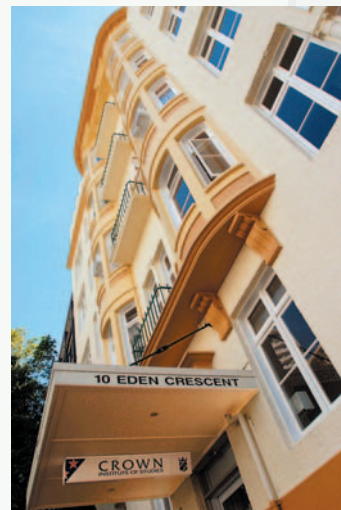
Crown - leaders in quality training since 1972