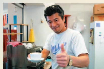
Great food, great service Crown cafe - English College ●