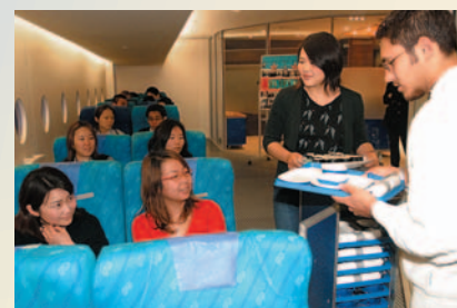
Flight attendant option Aircraft training facility - Business College ●