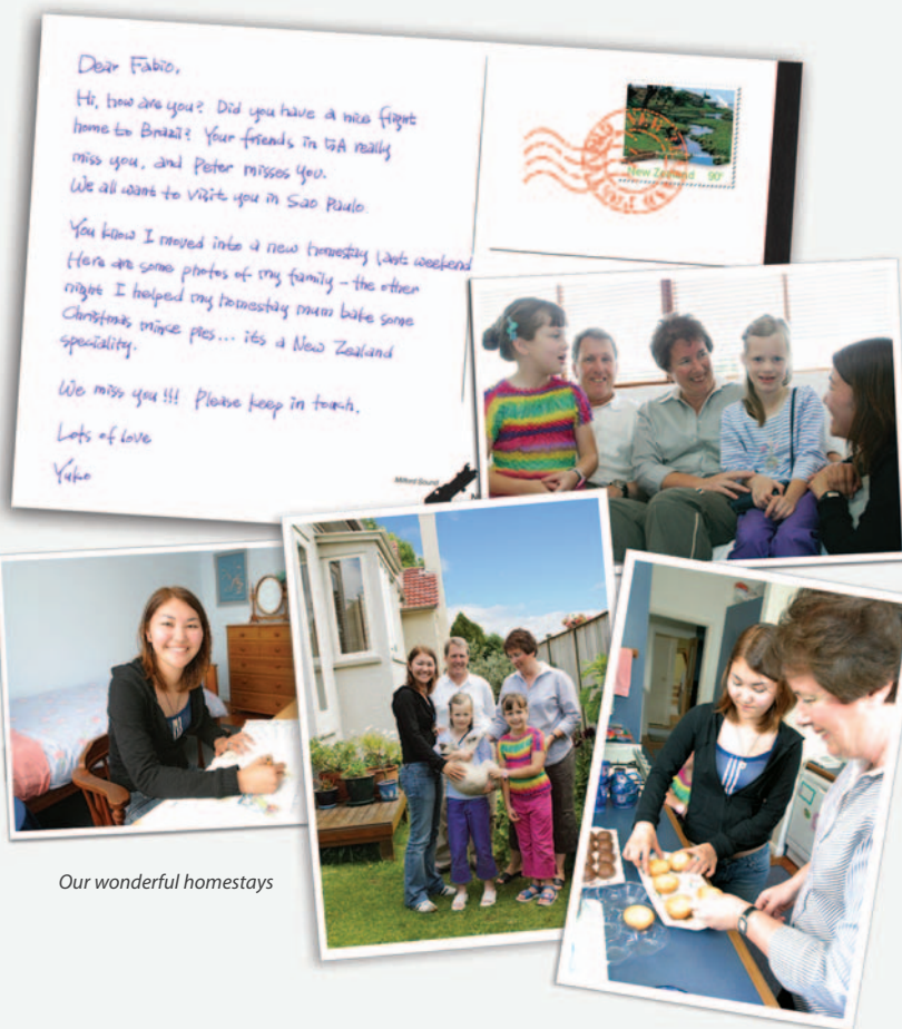
Our wonderful homestays

Our admin team - extend or change your course and renew your student visa right here at Crown.