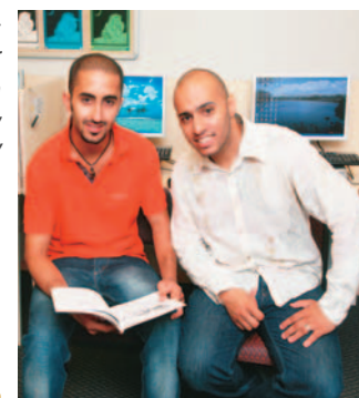
Self Access room - English College ●