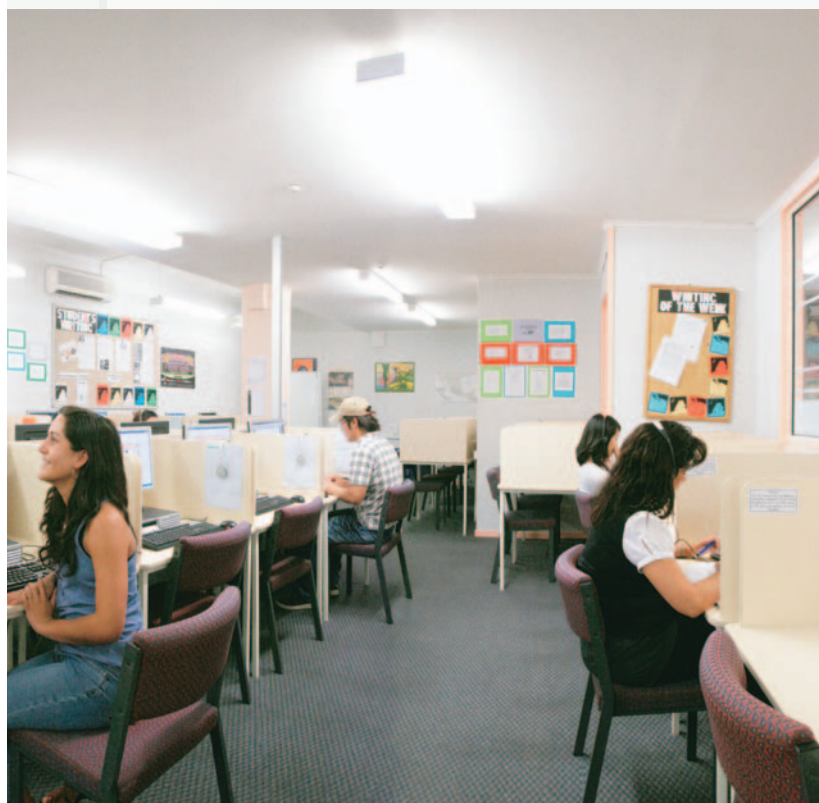
Location : Self Access room - English College ●