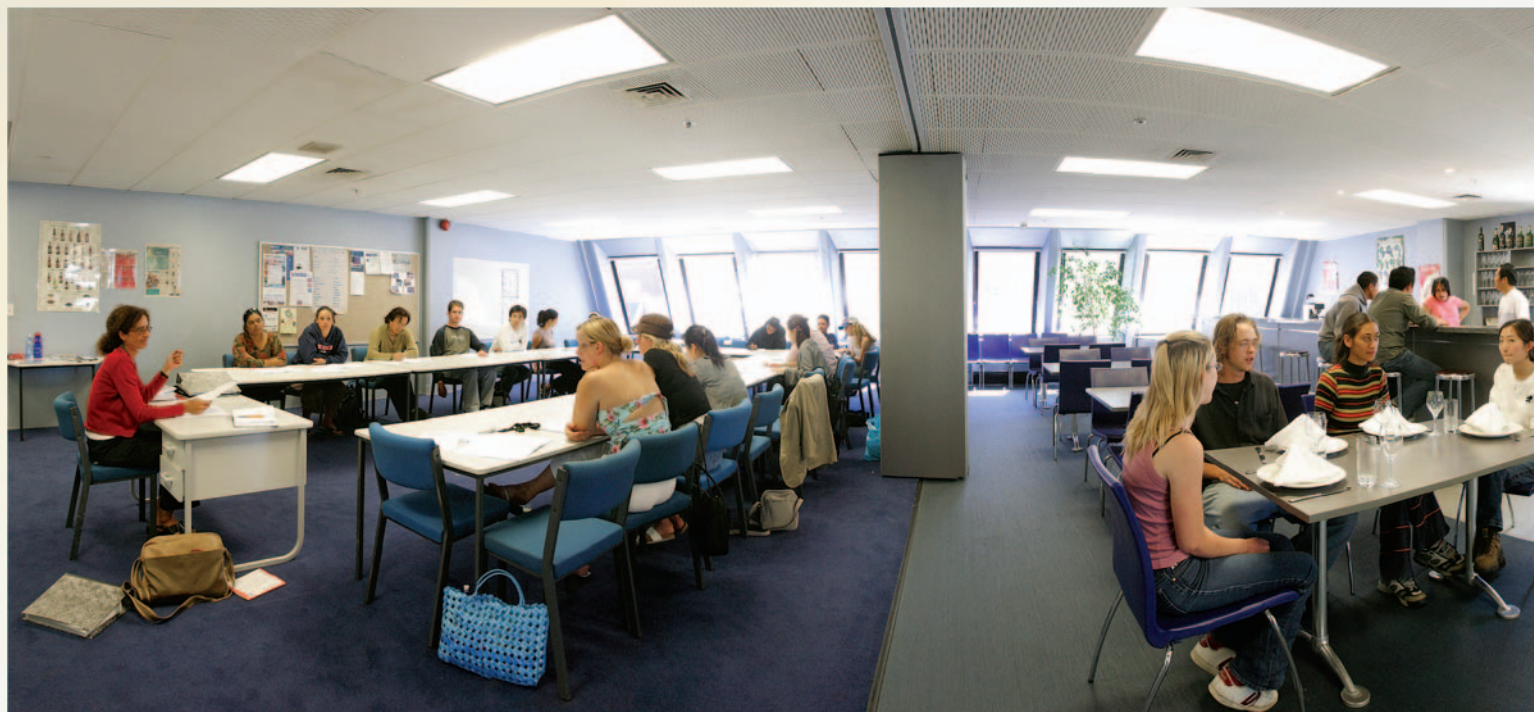
Study in modern spacious facilities