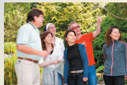
Activities option - learning by doing