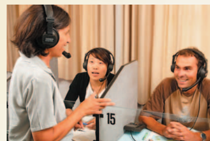
Pronunciation option - communicate in English Language Lab - English College