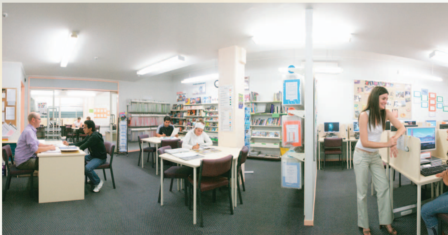
Individual Study Programme (ISP) - study at your own pace