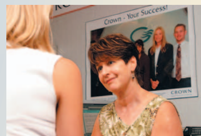
Career counselling and job placement Crown Career Centre - Business College ●