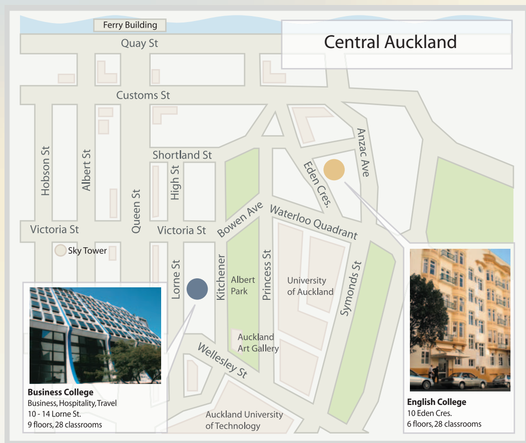
Two schools, one unique opportunity