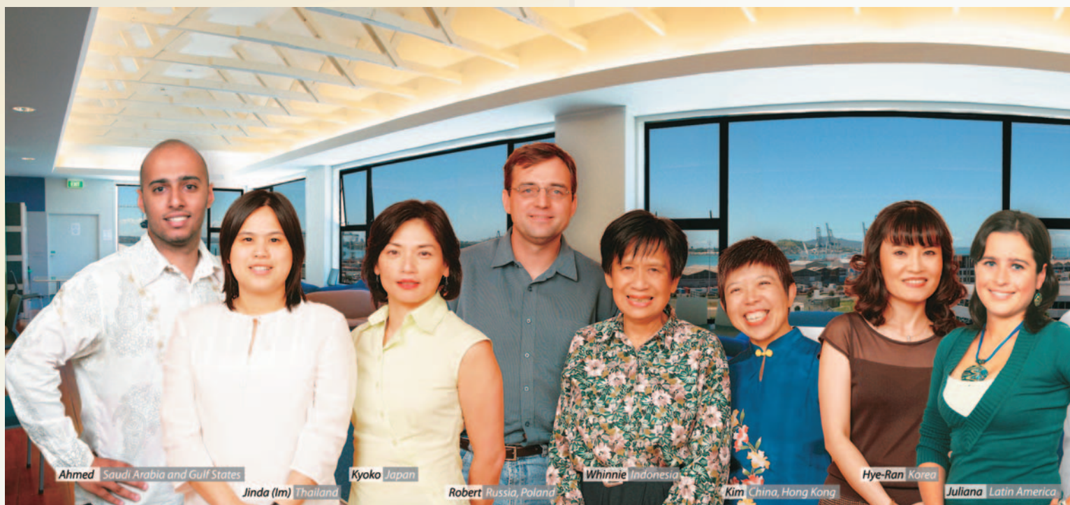
Crown counsellors - we speak your language and are here to help you. Our admin team - extend or change your course and renew your student visa right here at Crown.