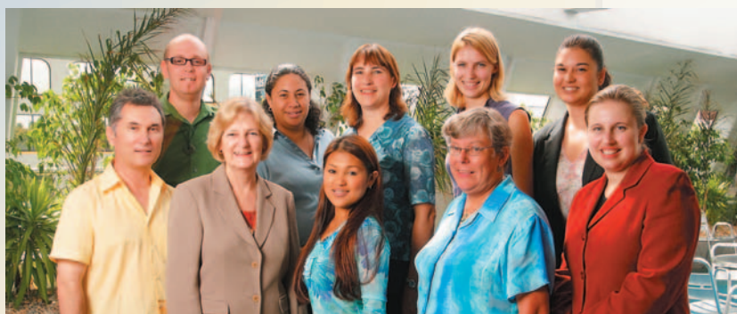
Friendly service from the Crown team Student common room - Business College ●