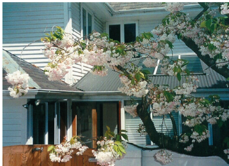
View of the school building from the garden