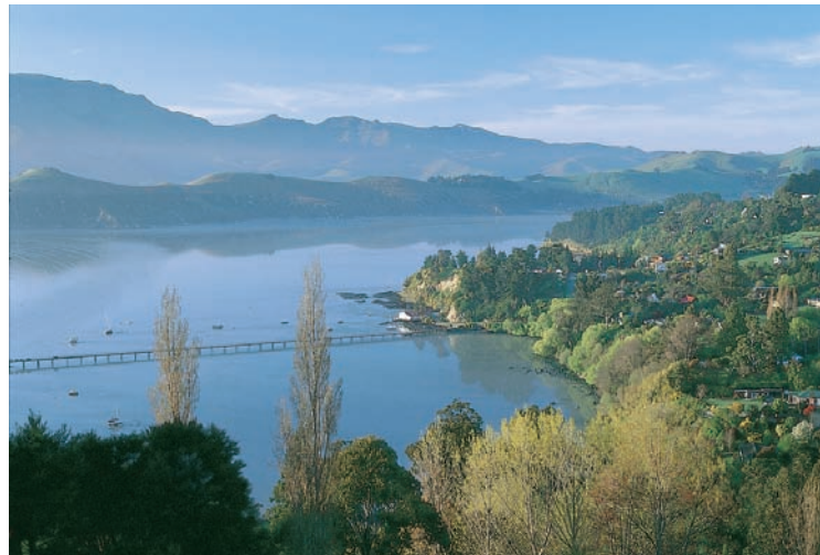
View of the Lyttelton Harbour from the Port Hills

New Zealand has neither nuclear weapons nor nuclear power stations.