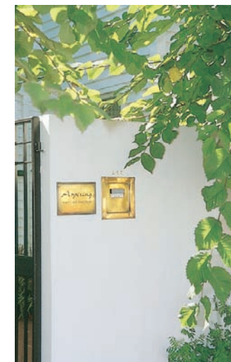
Entrance to the Institute