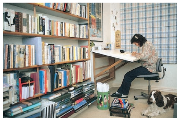
In the student's room

Each family hosts only one student. However, couples or those wishing to share a homestay with a student of a different nationality can be catered for.