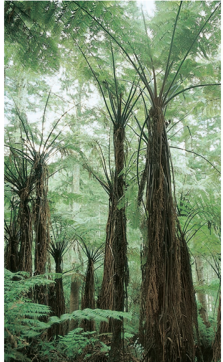
Native tree ferns