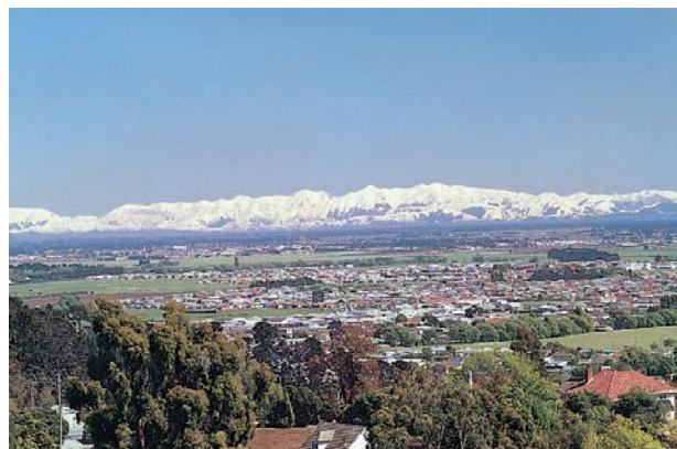
Christchurch from the Port Hills