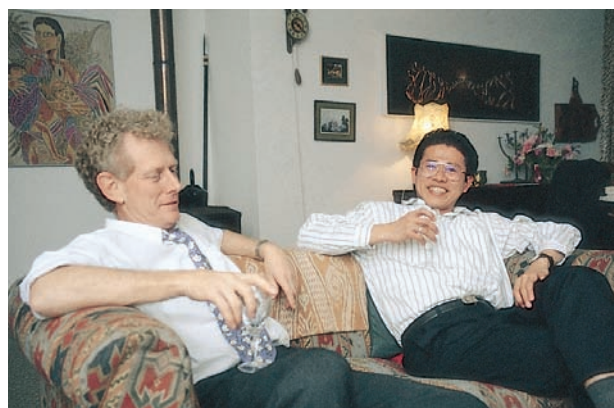
Relaxing with the host family in the evening

We take great care in choosing a hospitable, friendly Christchurch family for your homestay.