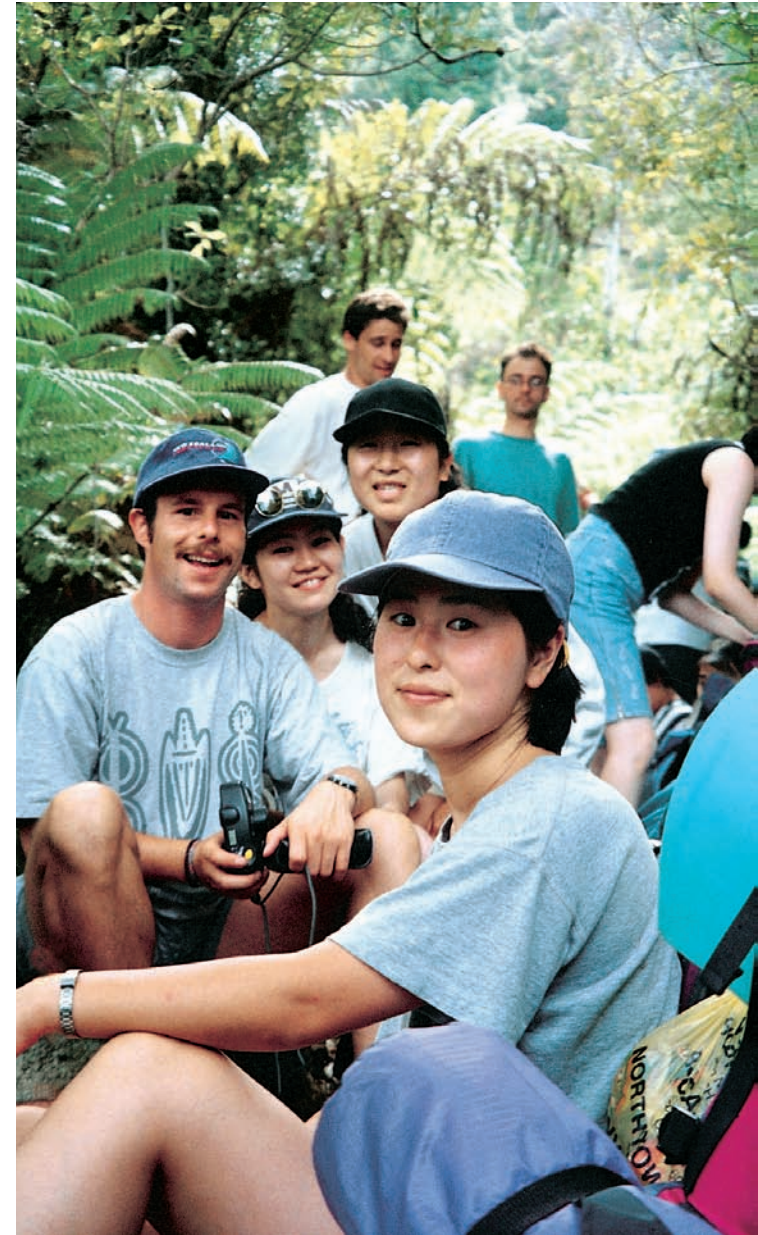
Tramping in Abel Tasman National Park