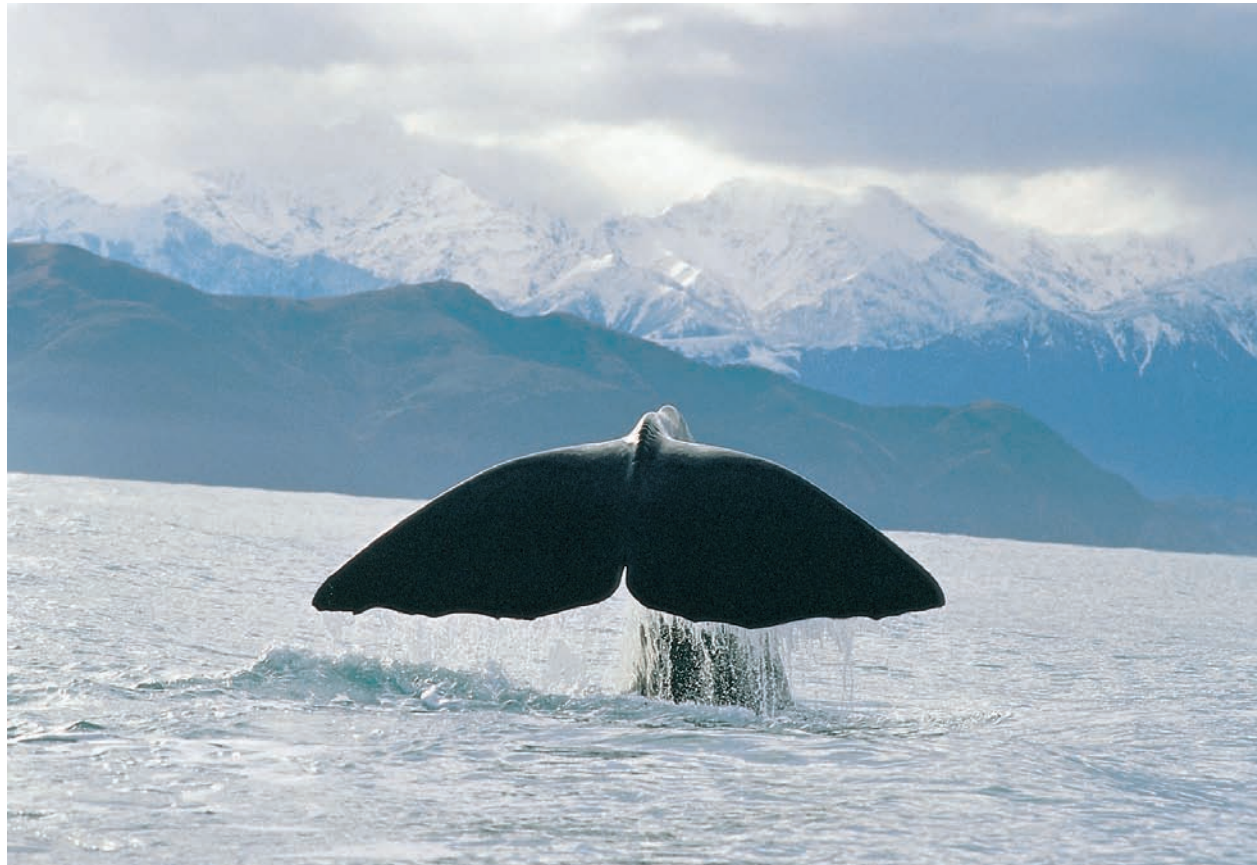
Whale watching, Kaikoura

Aspiring Language Institute • 242 Papanui Road • Merivale • Christchurch 8014 • New Zealand