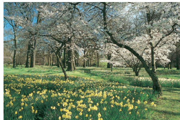
Hagley Park in springtime

Christchurch is also known as the “Garden City” because of its tree-lined streets, parks and private gardens.